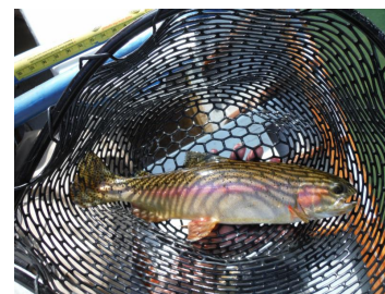
An Ozark rainbow from the Eleven Point River

Notice: MMTU Newsletter will be going to a mobile format soon.