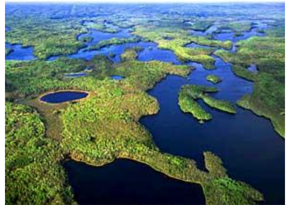
Aerial photo of the Boundary Waters

It is hard for me to believe that January is soon to past and the cold days of February lay ahead. With much regret I was unable to attend the January meeting which from what I've been told was enjoyed by all. I had hoped to share a fishing story or two as over the New Year weekend a close friend of mine flew in from California and he enjoyed his best fishing day at Bennet ever, while I probably caught more on dry flies than I have in a life time. Yes, that is correct...20 degrees and they were hitting on top. I have a very simple dry fly pattern that has really worked well in the park over the past few years. Perhaps I can actually show up for the February meeting and demonstrate just how simple it is to tie. Please remember, I tie flies to FISH not to look at or sell. (continued on page 2)