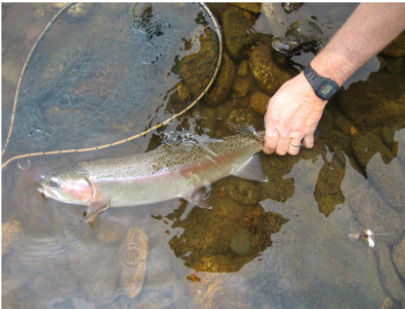
A fine Australian rainbow