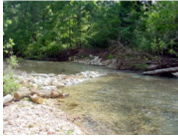
Wing dam on Barren Fork moves water toward the lunger structure on left side of photo