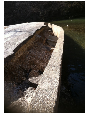
Flood Damage to the Circle Drive at Baptist Camp

Notice: MMTU Newsletter will be going to a mobile format soon.